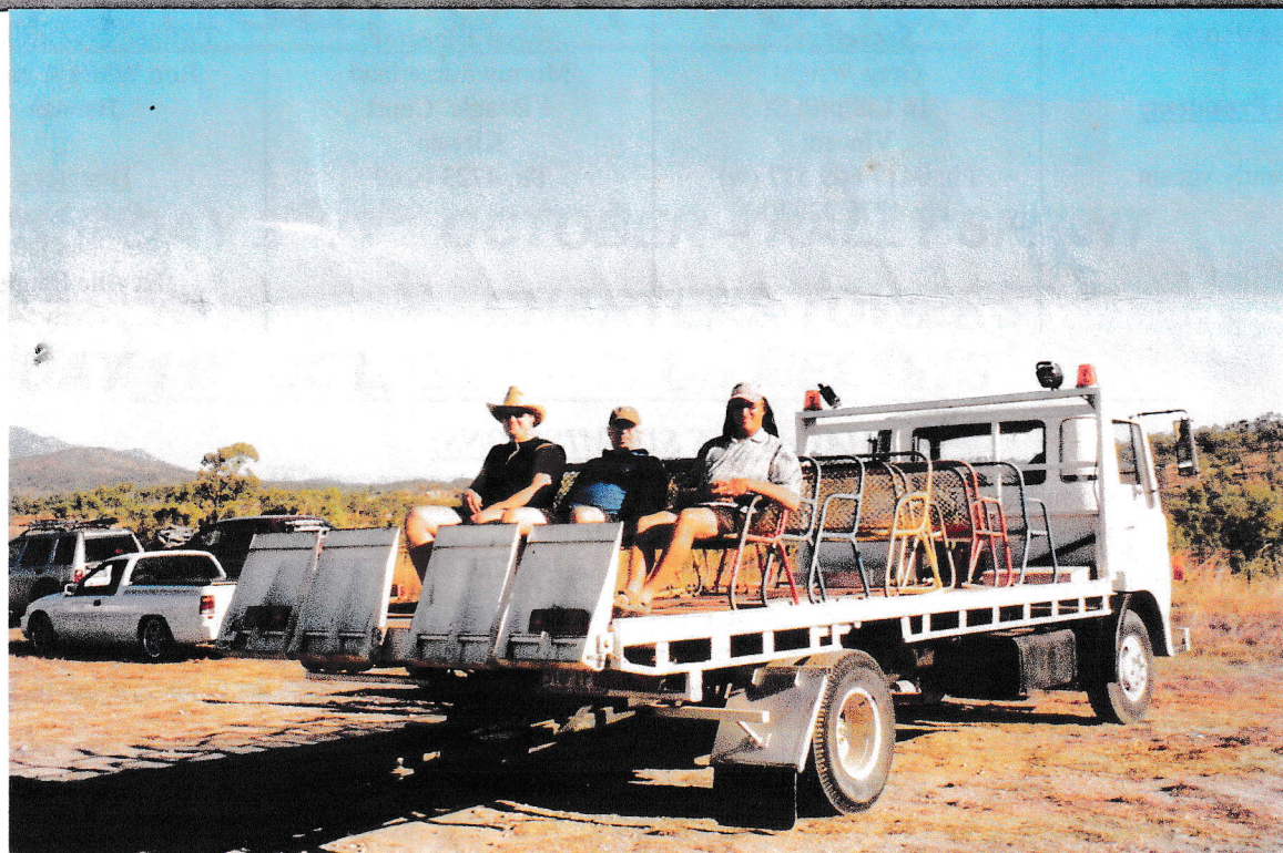
The three venerable old gentleman doing a hard days work while sitting on a park bench.